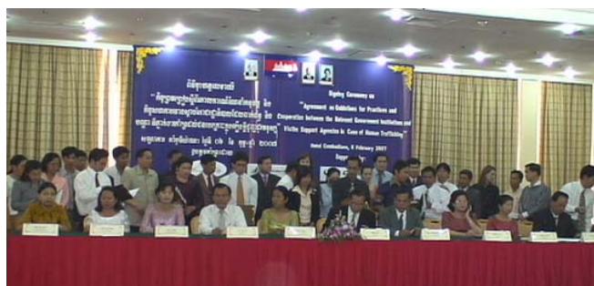
Signing Ceremony on “The Agreement on Guidelines for Practices and Cooperation between Relevant Government Institutions and Victim Support Agencies in Cases of Human Trafficking”

In order to link the Project closely with the national system developments will be reported to the National Task Force via COSECAM’s vice-chair of the Protection and Reintegration Working Group.